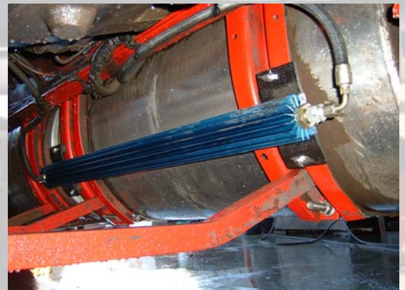
(Typical Fuel Cooler Installation)